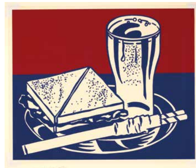
IMAGE: Roy Lichtenstein, Sandwich and Soda, 1964, screen print.

Exhibition organised by the Victoria and Albert Museum, London