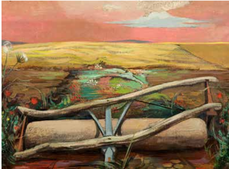
IMAGE: Michael Ayton, Field Roller, 1946. © Estate of Michael Ayton

The second in our series of displays focusing on landscape, The Language of Landscape shows work drawn from the fine art collection at The Wilson, embracing different ways of viewing landscapes by exploring mark-making, abstraction, and ways of expression.