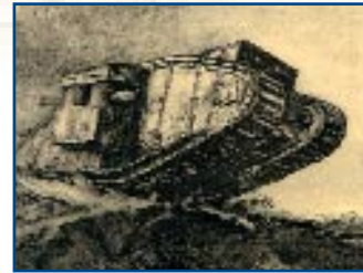
Tanks by Muirhead Bone

Bomber facing the Downs and John Piper's painting of bomb damage in Bath.